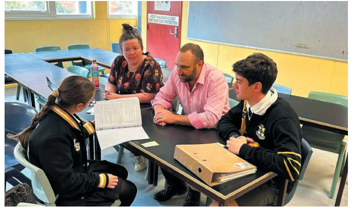
Relearning about the reproduction of fungi as part of a “Biology Bootcamp” at OHS.

What I saw was very impressive. Free karate and study “boot camps”, specifically art and biology. While it was great to see kids making the most of these programs, it is also helpful in supporting parents with the balance of work and caring responsibilities.